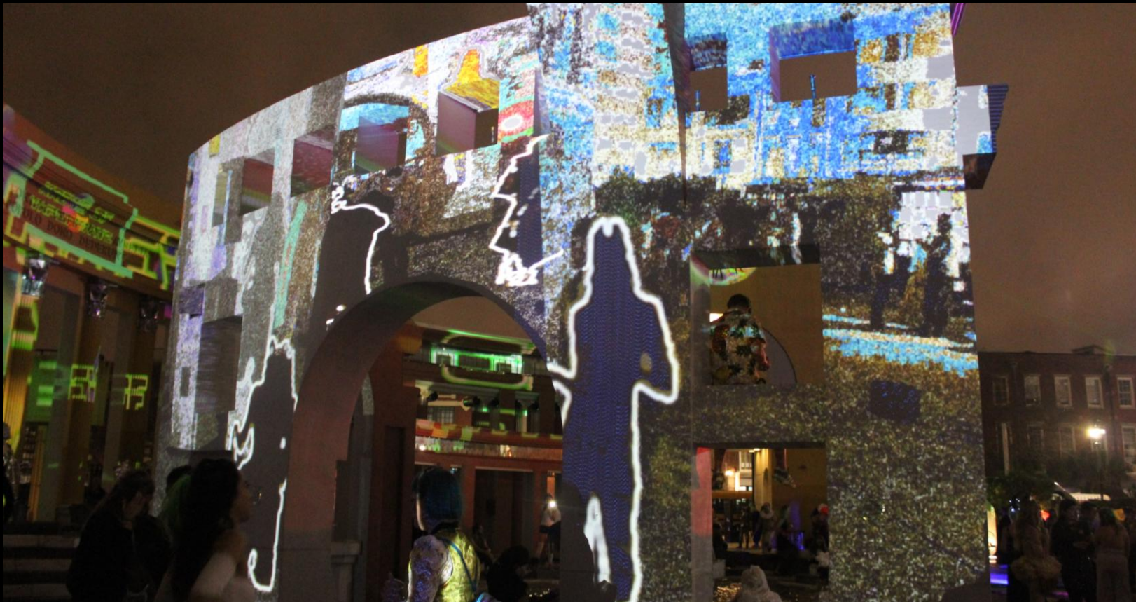
Chess in the Piazza – Oedipus MAX, Virtual Krewe of Vaporwave, New Orleans, LA

The works featured in this portfolio are all centered around viewer interactivity. The projects utilize a body-tracking camera to capture the images and/or outlines of viewers which are then superimposed in real-time onto video projections. As viewers stand in front of the screen, their bodies are captured and transformed. While the imagery featured in the installation is prepared ahead of time, the interaction between the viewer and their projected image allows for an infinitely vast array of experiences and interpretations.